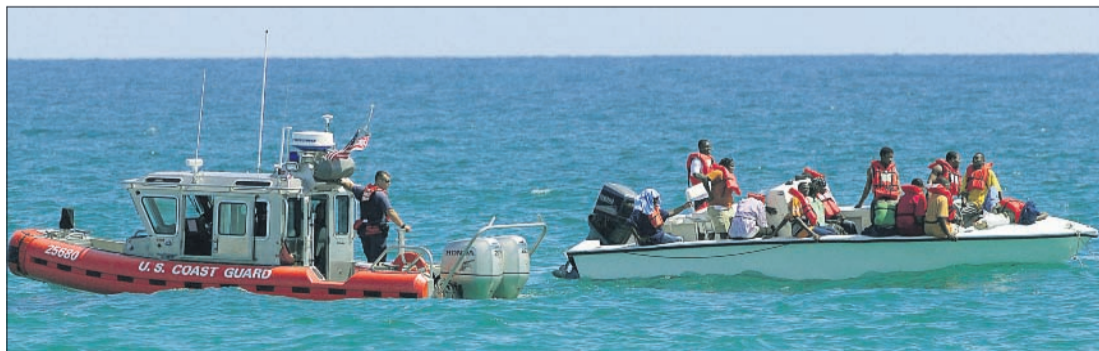
Coast Guard officials detain suspected illegal immigrants in a 25-foot boat off the coast of Jupiter Island. Two men made it to shore, were detained and have been turned over to Immigration and Customs Enforcement authorities.