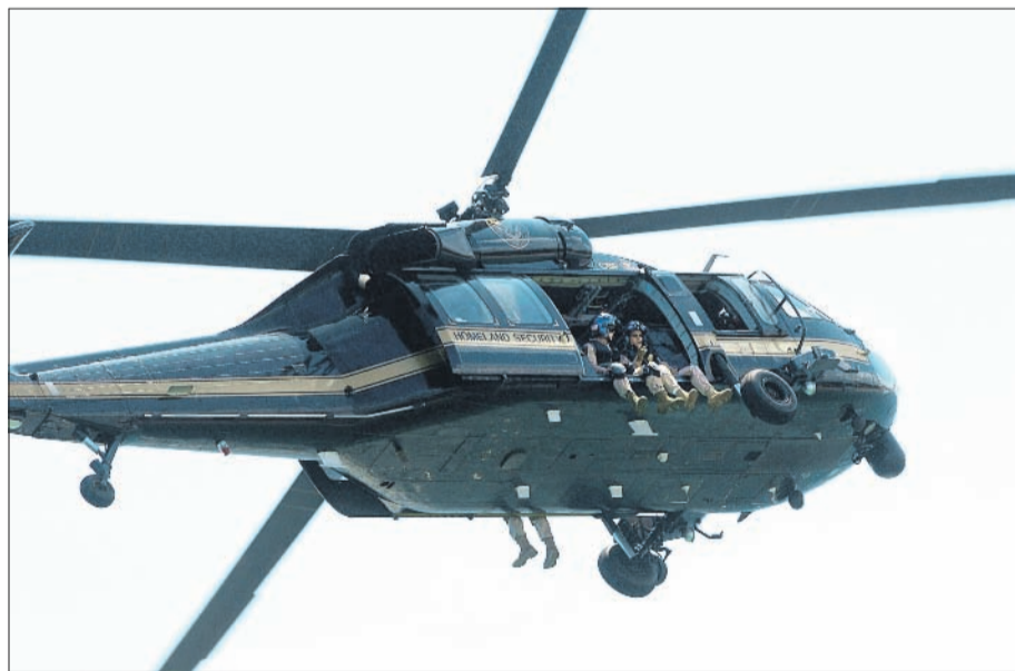
A Department of Homeland Security helicopter crew scans the waters off Jupiter Island after receiving a report of the boat full of suspected illegal immigrants. This is the sixth time in about a year authorities have captured immigrants on the island — one of America's richest towns.