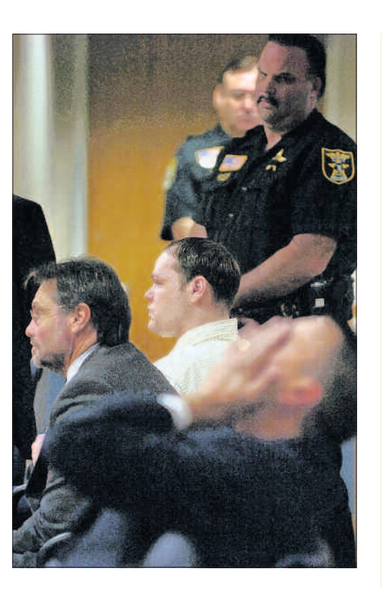
TCPALM.COM: View a copy of the verdict form and more photos online.