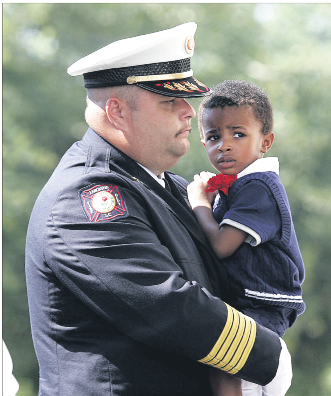
The son of a fallen Charleston, S.C., firefighter, is carried into the North Charleston Coliseum by a Lancaster firefighter Friday in North Charleston, S.C.